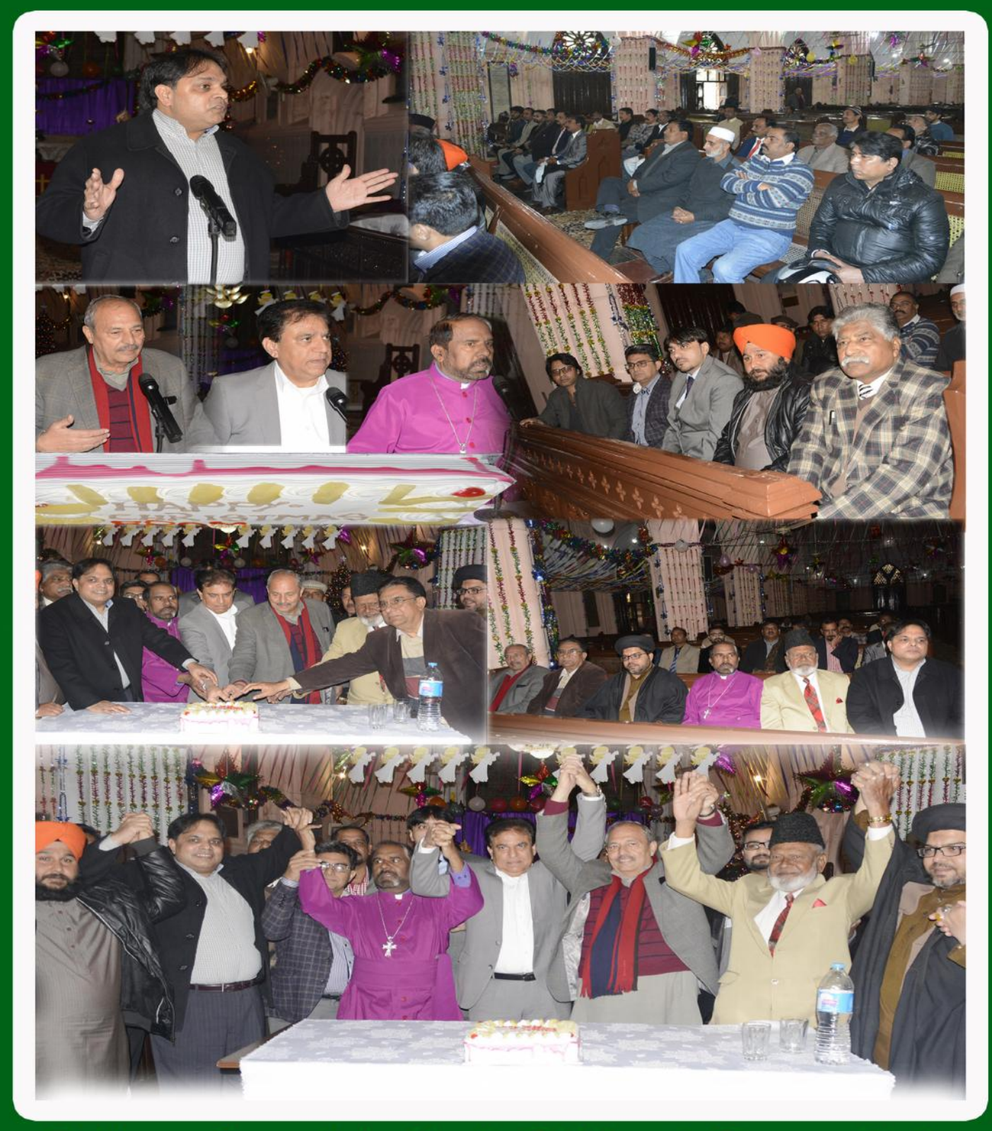
Pakistan Council for Socila Welfare & Human Rights

Muradia Road Model Town Sialkot 51310 - Pakistan Ph: +92-52-3563809 Fax: +92-52-4588276 Email: pcswhr@gmail.com; URL: www.pcswhr.com