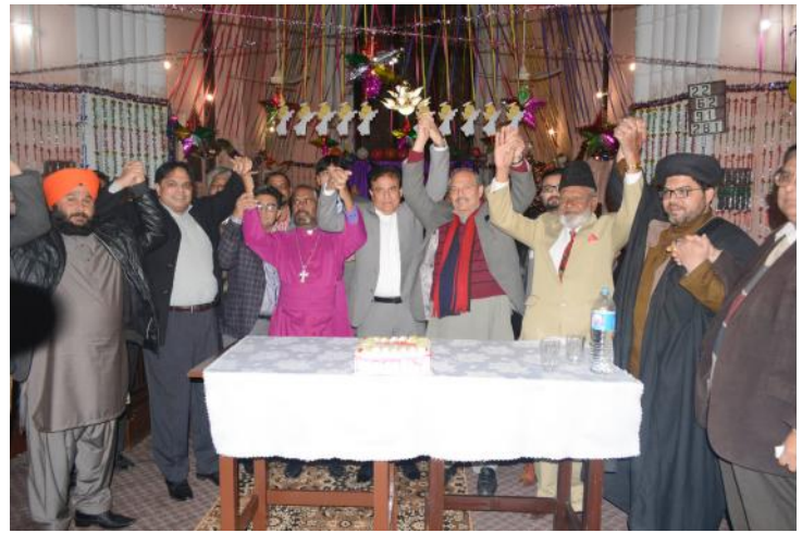
Christian, Muslim and Sikh Leadership raising their hands in chain to show national solidarity and unity