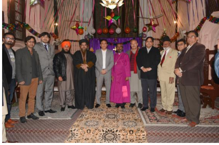
A group photo of Christian, Muslim and Sikh Leadership during the Interfaith Christmas Cerebration ceremony